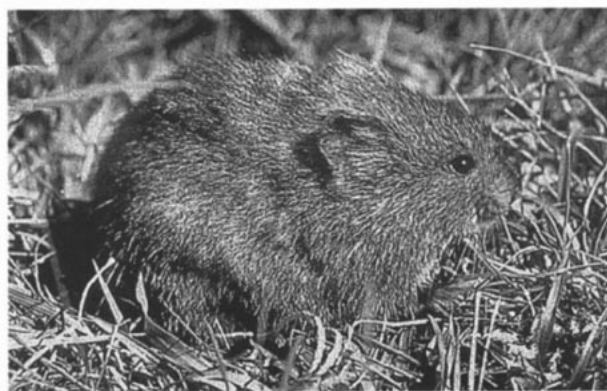
FIG. 1. An adult Microtus xanthognathus from Hess Creek, 150 km NW of Fairbanks, Alaska.

FORM AND FUNCTION. Microtus xanthognathus has a basal metabolic rate, as measured by oxygen consumption (mean \pm SE) of 1.44 \pm 0.089 cm 3 g -1 h -1 ( n = 5 ), minimal thermal 'conductance' in terms of oxygen consumption of 0.116 \pm 0.0057 cm 3 g -1 h -1 °C -1 ( n = 22 ), and a basal temperature of 38.0 \pm 0.16 °C ( n = 21 —McNab, 1992). Scent glands are present on flanks of both male and female taiga voles, and may be conspicuous in males. Two meibomian or tarsal glands (enlarged sebaceous-type glands) occur in the dorsal eyelid and one in the ventral eyelid ( n